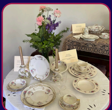
China demonstration at Art of the Dish exhibit

To attend the china exhibit only, $8 museum admission will apply and can be paid at the door.